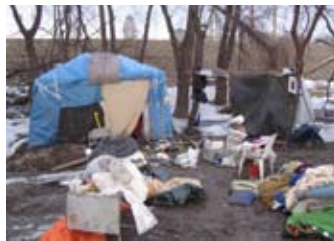
A camp south of downtown is a home for homeless adults.

The quantity and quality of the lunches show how much time, thought and love you and your children put into them, and how much you care for our city's homeless people! The pictures and words of hope drawn on many of the sacks was a nice touch. They make people smile and know they are being thought about. We love to share with our homeless friends how many people are thinking about them and praying for them, and we've had the opportunity to mention the people from Gloria Dei on a number of occasions these past few months.